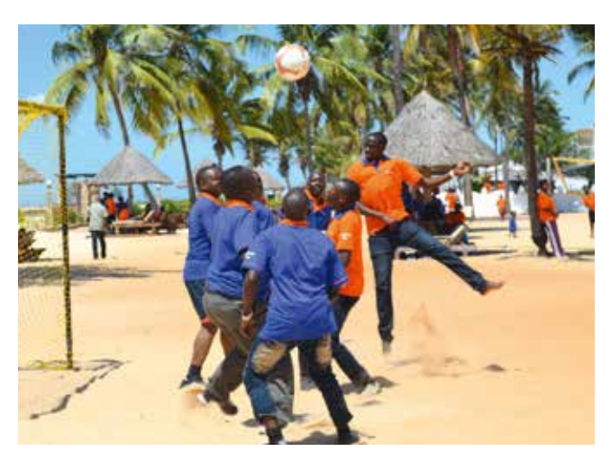
EWURA staff and family members in a football match during the EWURA Family Day hold in August 2015, in Dar es Salaam.