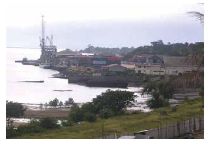
A view of Tanga Port from a distance. The Port has now become an alternative route for oil imports.

The objective of using Tanga Port is to reduce traffic and congestion of trucks from various regions at Dar es Salaam Port and reducing damage to the environment and road